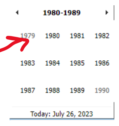
Step 04: If the calendar is stopped to moving backward and forward direction then click again on any year and move backward and forward direction of year.